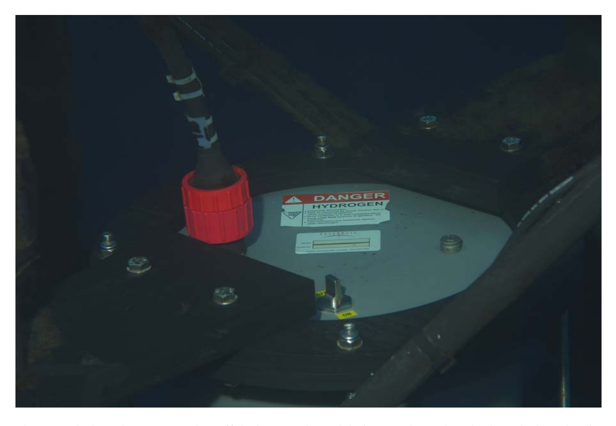
Figure 1. The buoy battery was taken off the buoy, recharged during one day and put back on the buoy by divers.

Laboratoire d'Océanographique de Villefranche (LOV), 06238 Villefranche sur mer cedex, FRANCE